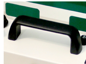
Practical and sturdy carrying handle